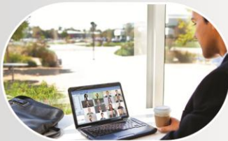
High Definition Video Conferencing HDVC