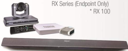
RX Series (Endpoint Only) * RX 100