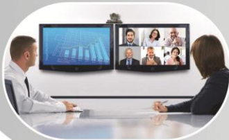
Unified Telepresence UTP